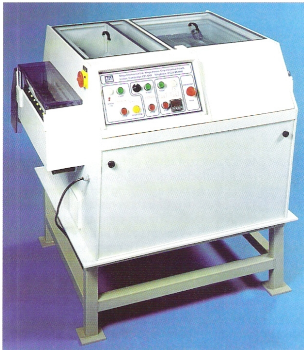
Illustrated model DL500DS with stand

Accessories available for the processor include a stand, link inspection modules, catch trays and cooling systems.